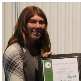
Mara Key Award