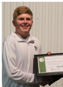
Layton Key Award