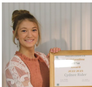
Cydney Outstanding 4-Her